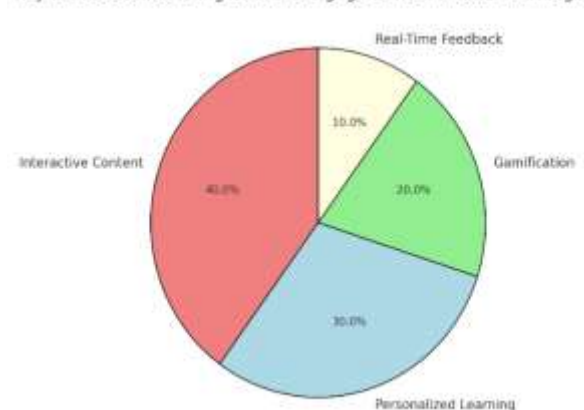
Key Features Influencing Student Engagement in Mobile Learning Apps

Description: A bar graph comparing student participation levels in traditional classroom settings and those using mobile learning apps, showing higher engagement in m-learning environments.